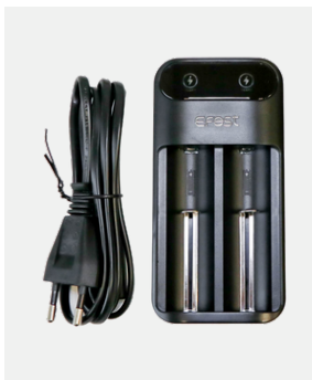
CHARGER Forn 2x Li-Ion Battery (Charging time 4 hrs.)