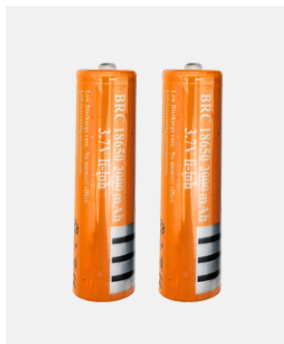
2 X 18650 ERSATZ-AKKUS Art. 264 Suitable for MR 96 E