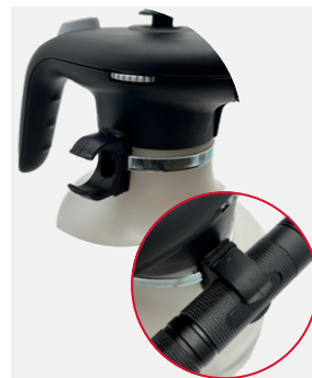
HOLDER FOR 96E Art. 1093 FOR PRESSURE PUMP ATOMIZER for Pressure Pump Sprayer 1,5 liter mountable on Art No. 4717 + 4718